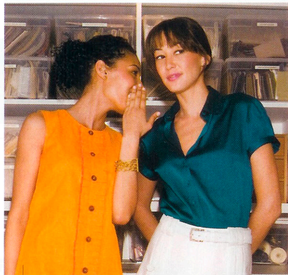
Psst...the real juice is, all that yammering with office buds is totally eating away your workday.