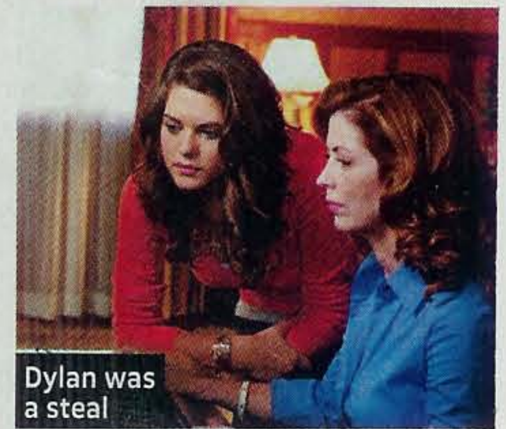
Dylan was a steal

Lane's battered neighbor admitted not only to burying her daughter Dylan in the woods after the kid was accidentally crushed to death years ago, she copped to zipping off to Romania to get a child to replace her in what had to be one heck of a suspiciously quick adoption. "I found a girl in a Romanian orphanage who looked just like Dylan," she said—as if a woman could just fly in and pick up a child at the cash-and-carry shop, then drop said child in her dead daughter's place without a hitch. I was offended on behalf of Nadia Comaneci's people. So I did a quick search. And, shut my mouth, apparently such adoptions were once a problem. According to a 2005 Helsinki Commission report, the Romanian adoption system had gotten so corrupt in the '90s that the Romanian government banned intercountry adoption. Now it's next to impossible for law-abiding people who want a baby to adopt a Romanian child. Way to ruin it for other folks, Katherine.