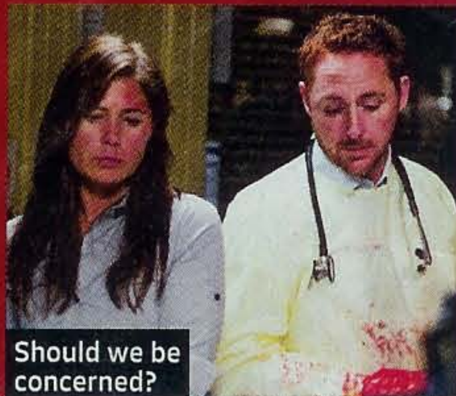
Should we be concerned?